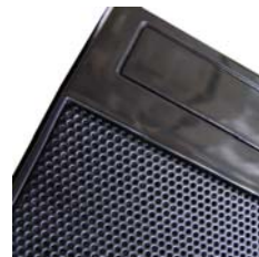
Slim 5.25 Drive