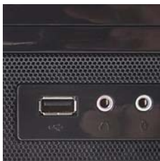
Front USB & Audio