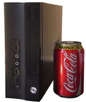
Small chassis. (A4 size)