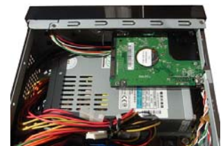
2.5" HDD & PSU (Not included)