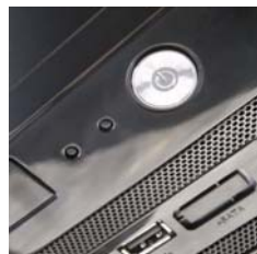
On / Off button