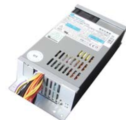
PSU with bracket